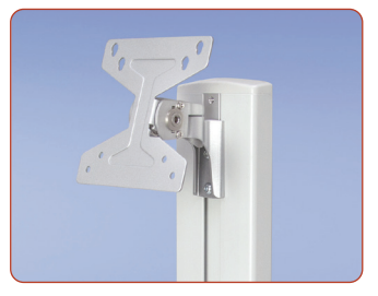
Height Adjustable Tilt Swivel Monitor Mount