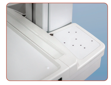
Pre-Drilled Rear Bin Scanner Plate