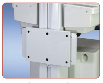
Sharps Bracket (Available for side mount)