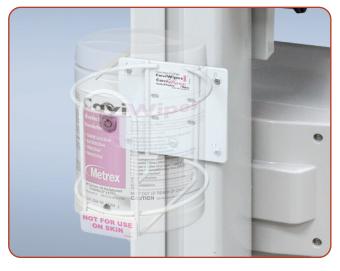
Sanitizing Wipes Bracket