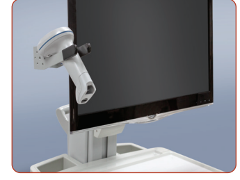
Forked Scanner Holder

Check with your Capsa Healthcare regional sales manager about these and more accessories specific to your chosen point-of-care solution.